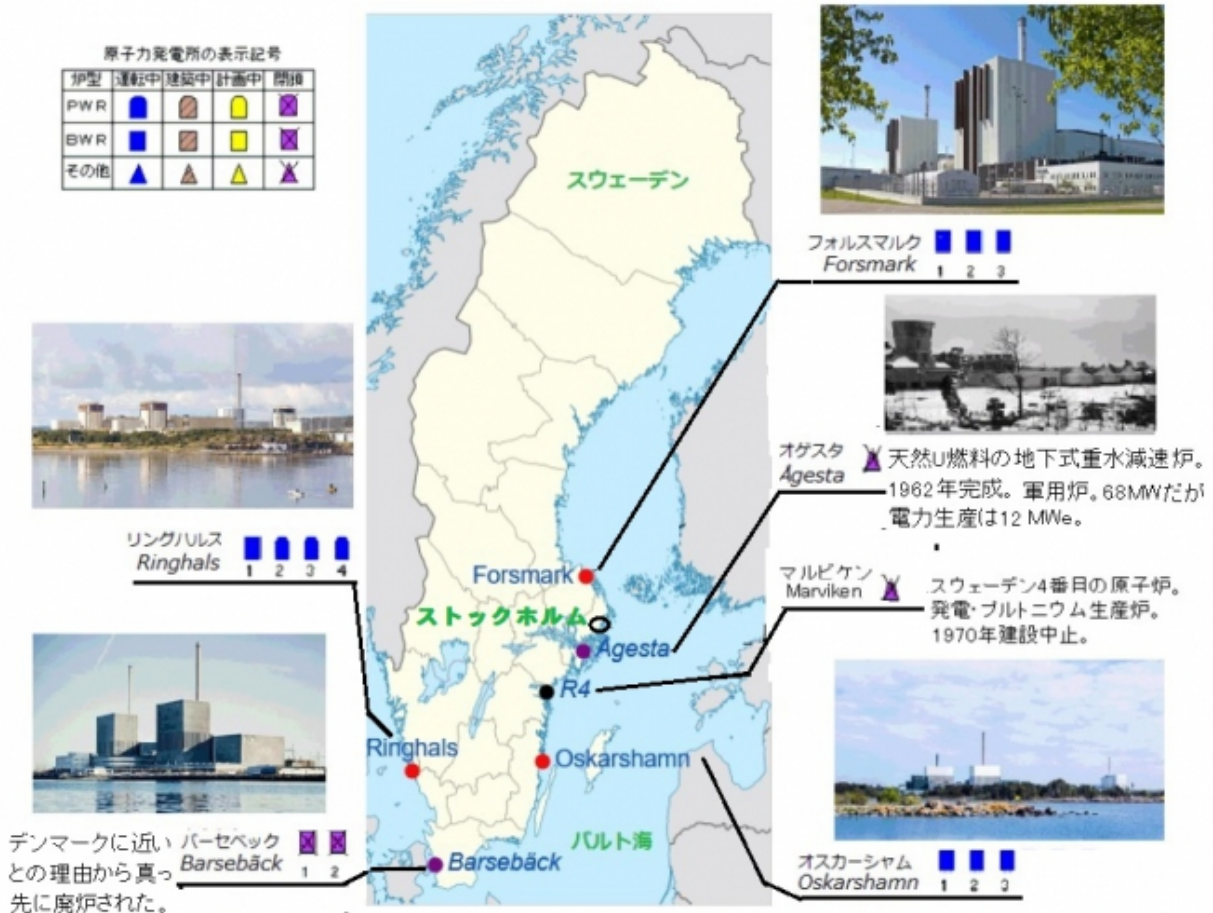
図1 スウェーデンにおける原子力発電所の配置図 (運転中10基)